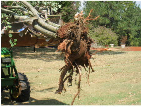
"A BIG ONE"